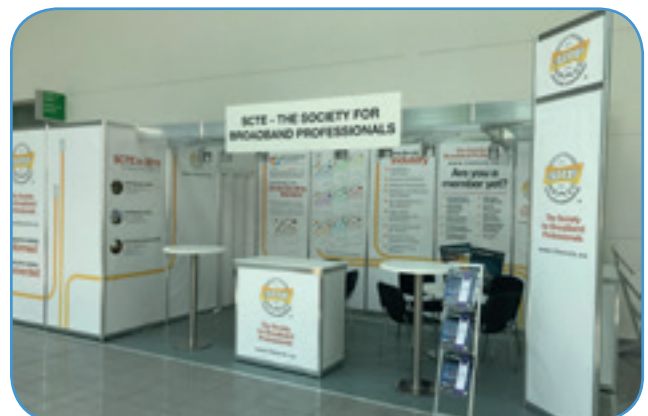
The SCTE stand at ANGA COM

The Society and ANGA have a long history of cooperation. They have worked together for many years on conference sessions at ANGA COM. This year, the panel session entitled