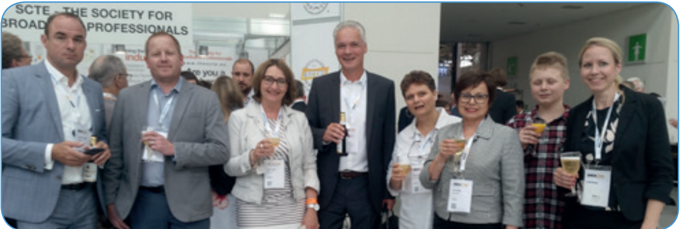
The ANGA team at the SCTE booth party at ANGA COM