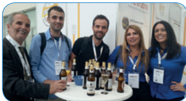
The SCTE held a party for its bursary winners and members at ANGA COM